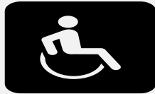
Persons with Disability

With cases that came through the Free Helpline, 40% of the calls were seeking online counselling and advisory enquiries to SVSG.